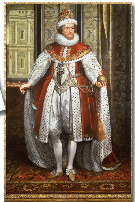
KING JAMES I

It is a King, and therefore God's commands come before his. The King is a mortal man, not God, therefore hath no power over the immortal souls of his subjects, to make laws & ordinances for them, and to set spiritual lords over them. The King has authority to make men, but not to make immortal souls. Men may be seduced by deceivers to fight against God, whom they ought to obey, nor against the laws of God, which they ought to obey, nor to set up their own wills and ends, or to take their lives in their hands, or to take the lives of others. God Save the King Tho. Helwys